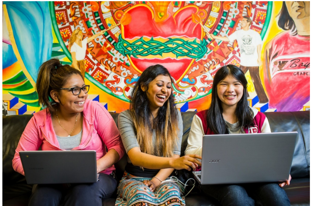
Former IELP students on PSU's Office of Global Diversity and Inclusion website