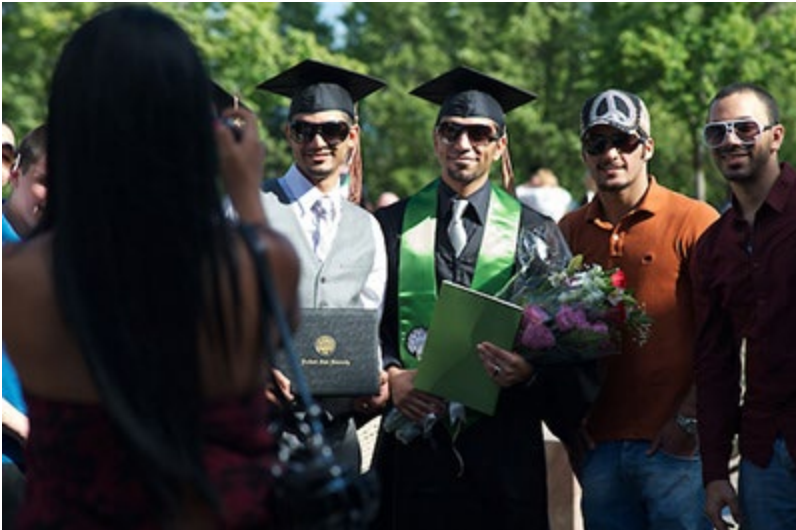
former IELP students