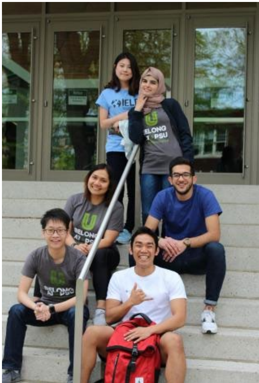
IELP Peer Mentors